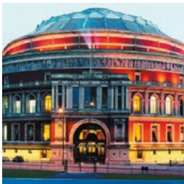
The Royal Albert Hall