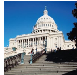
Multiple US Government Facilities