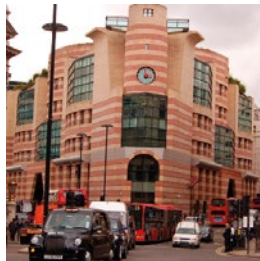
No. 1 Poultry Building